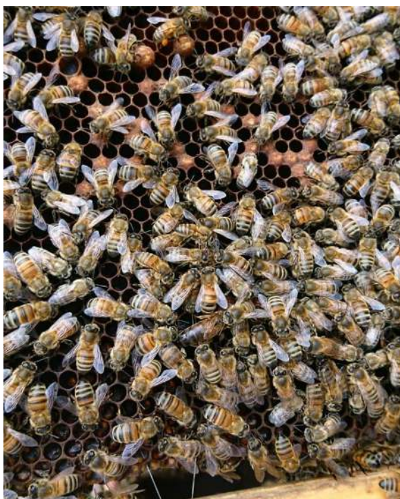
Can you spot the Queen? (See next page)

Another insect that has been in the news lately is the ladybird – well known for its importance in controlling pests, especially aphids. There are 47 different kinds of ladybird in the UK. Twenty six of these are brightly coloured, and the commonest is the 7-spot which lives in places like nettles, brambles, gardens, apple trees, long grasses and hedgerows. It has three spots on each red wing case, and one in the middle (half on one wing case, half on the other). The smaller 2-spot is also common (2 black spots on a red background). The 2-spot has a black form as well as the red form, which confusingly can have two to four red spots on a black background.